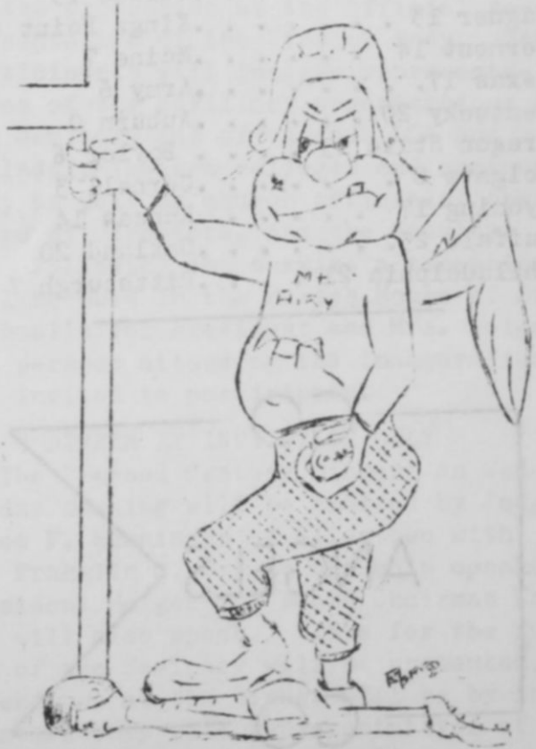
STAMP OUT GETTYSBURG